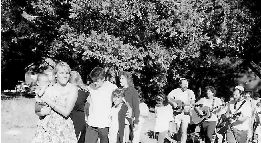
My early years at Camp Tawonga